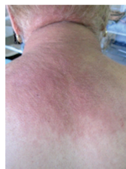
Figure 2. An indurated erythematous plaque affecting upper back and nape of the neck

erythematous, firm non tender papules and nodules, ranging from 0.5 to 2 cm diameter, on the face, scalp, retro-auricular, upper back and the left forearm with mildly pruritic sensation ( Figure 2 ). There were two erythematous indurated plaques on the left forearm and upper back and nape of the neck there were indurated erythema plaques ( Figure 3 ). Other physical examination was unremarkable except for mild pitting edema which was noticeable both on her hands and feet.