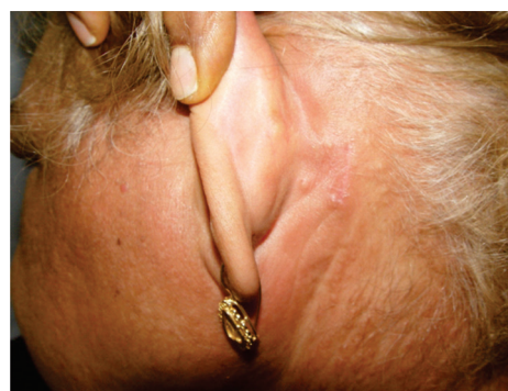
Figure 6. Significant resolution of skin color nodules in the retro auricular area.

of LM in the literature: a generalized papular or sclerodermoid form (called scleromyxedema) and a localized papular form. 1