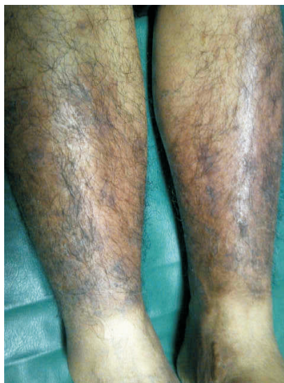
Figure 2. After being given treatment